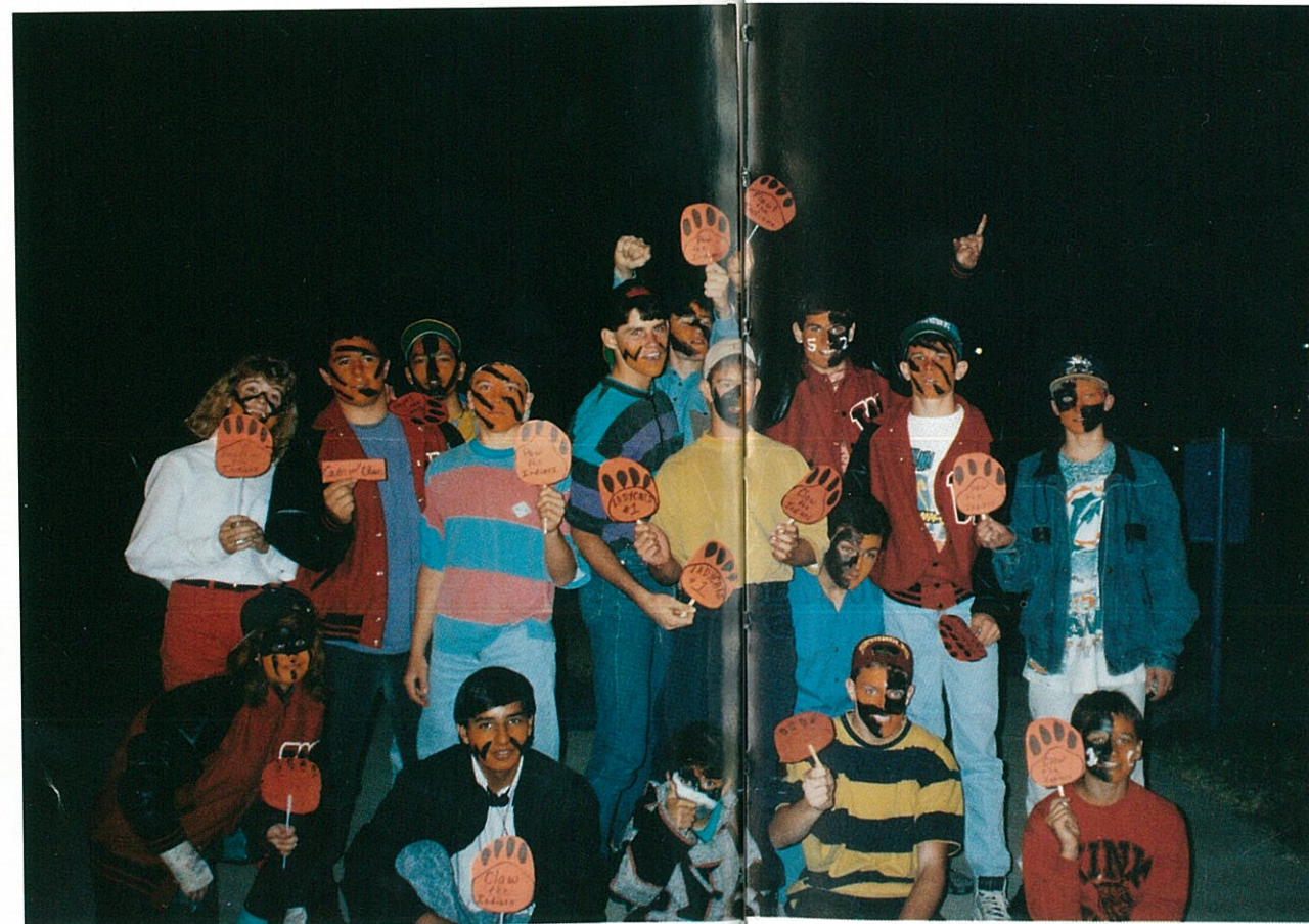
The student body painted their faces and waved signs to support the volleyball girls during the area match.